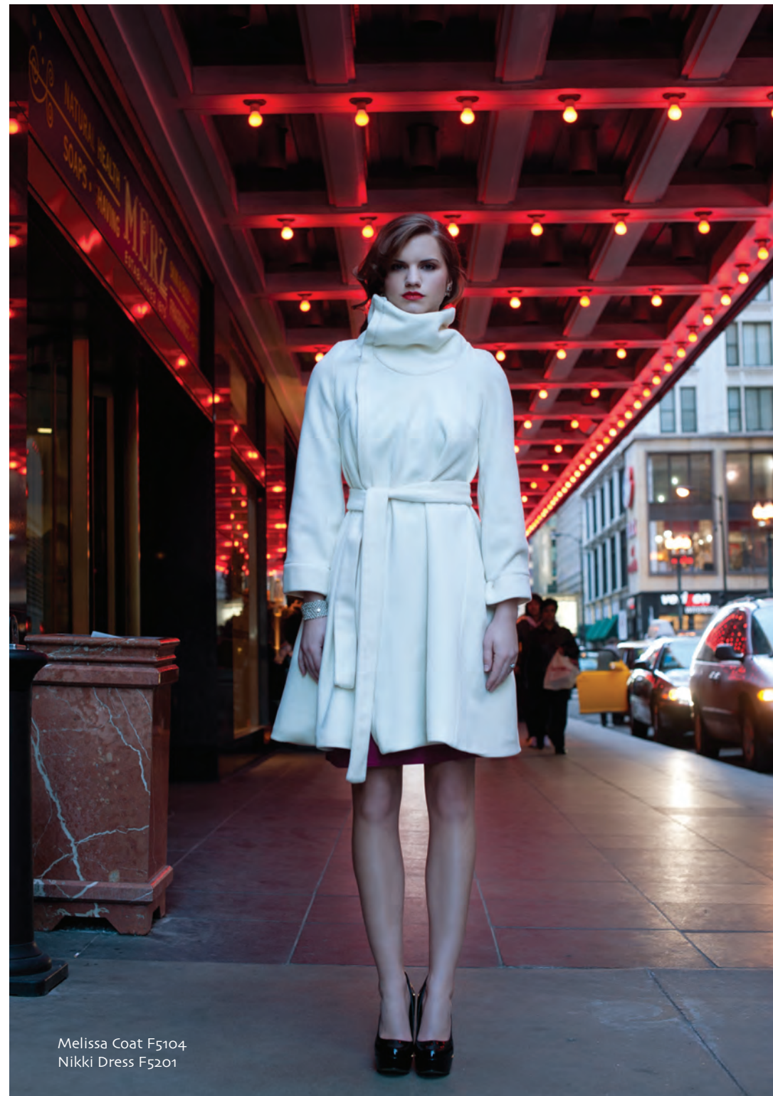
Melissa Coat F5104 Nikki Dress F5201