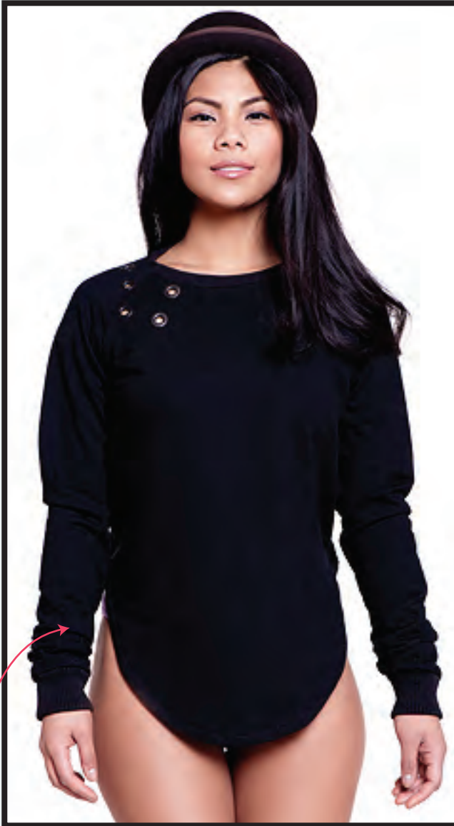
Extra Long Sleeves