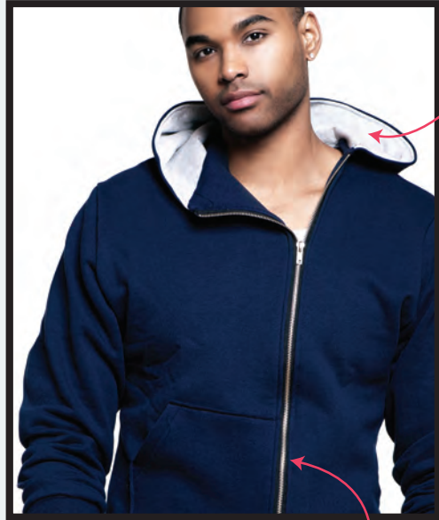
Contrast hood lining