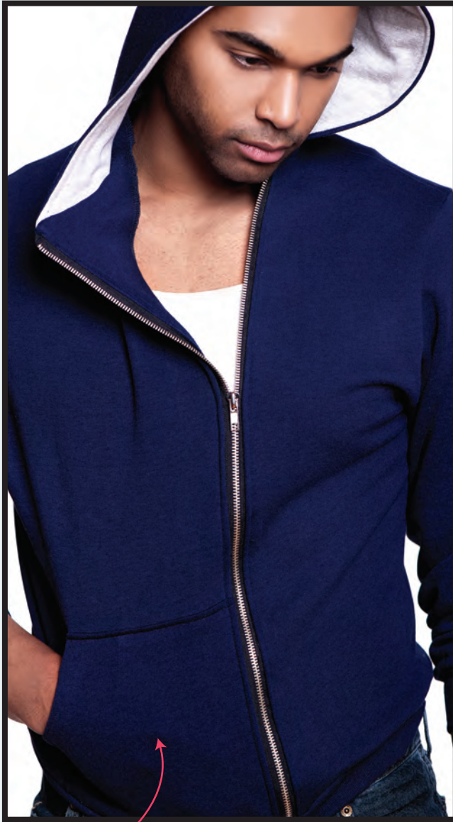
One front pocket