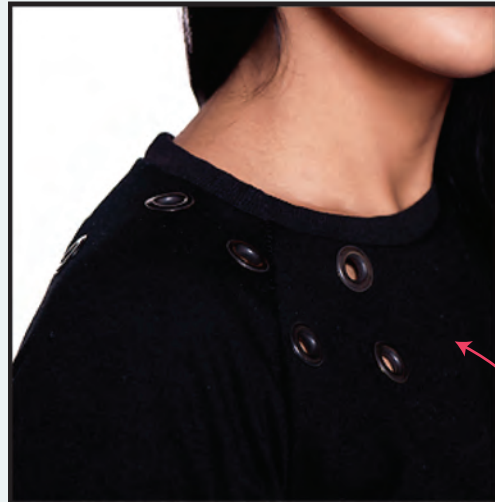
Grommet detailing on right shoulder